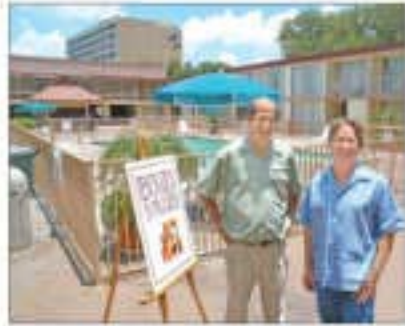
See Historic Downtown Hotel, Page 4B